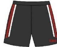
PE SHORTS BOYS