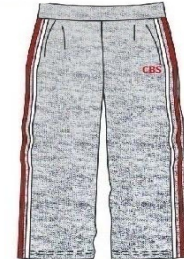
PE PANTS GIRLS