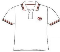
SHORT SLEEVE POLO T-SHIRT